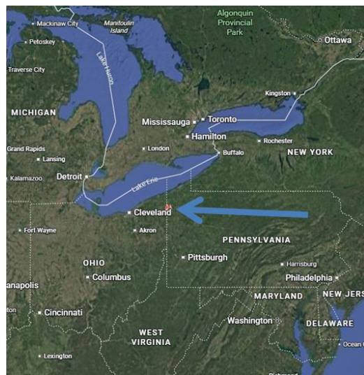
Lake Pymatuning / Reservoir Borders Ohio and Pennsylvania